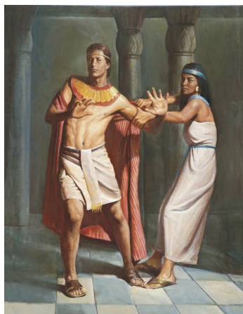
Joseph Resists Potiphar's Wife