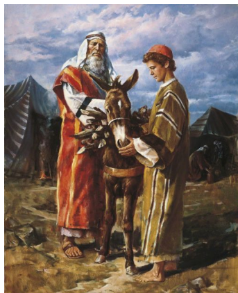
Abraham Taking Isaac to Be Sacrificed